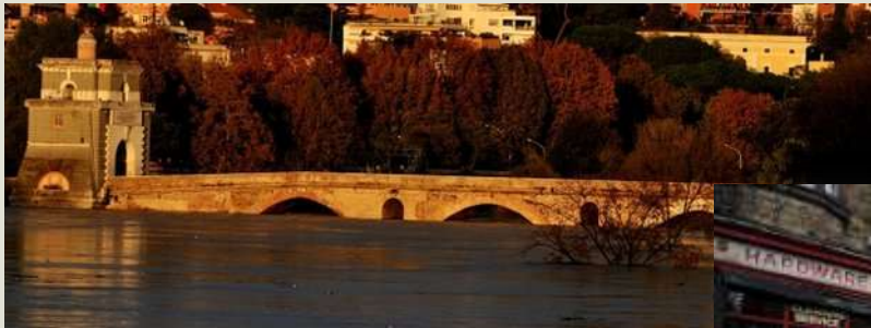
Floods in Europe

Turkey rations water as cities hit by drought